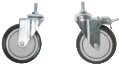
1" Post Casters