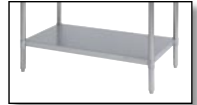
Galvanized Undershef for Worktable