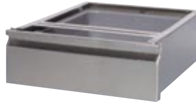
Stainless Steel Drawer Assembly