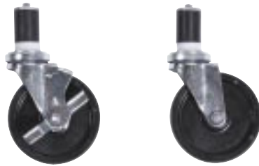
Work Table Casters for galvanized legs