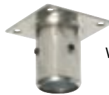
Wood Top Brace