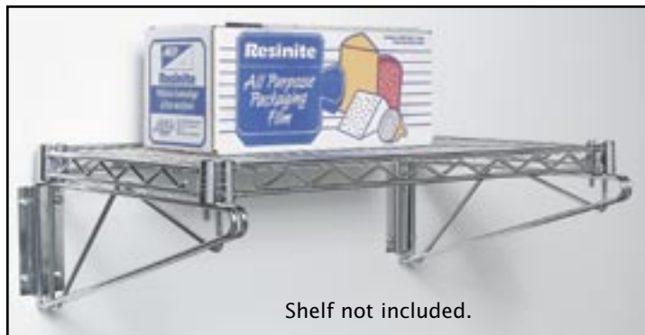
Shelf not included.

Order two Post Kits per unit and two Post Shelf Brackets per shelf. Shelves sold separately.