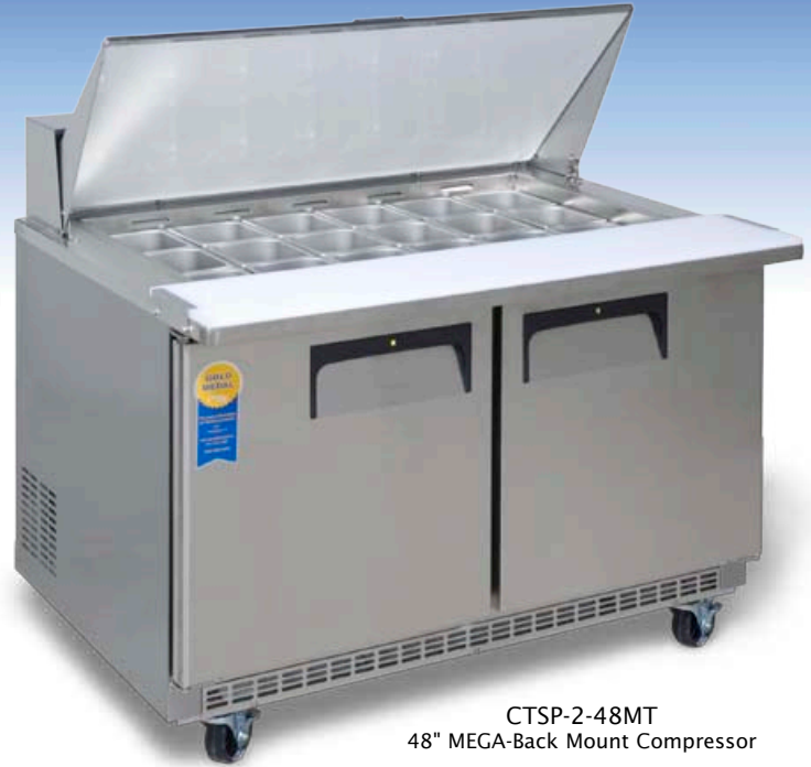
CTSP-2-48MT 48" MEGA-Back Mount Compressor