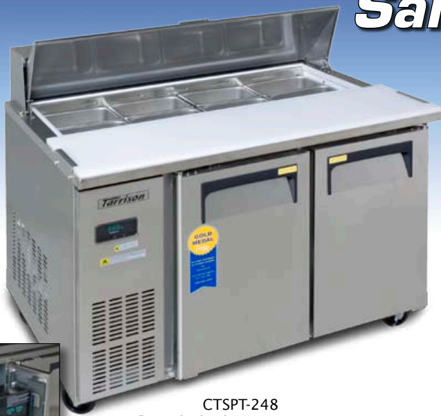
CTSP-248 48" Standard Side Mount Compressor